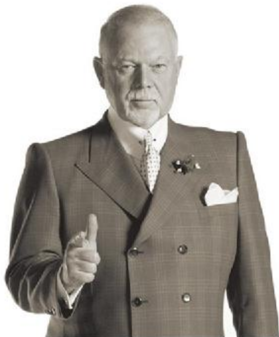
Don Cherry, Hockey icon